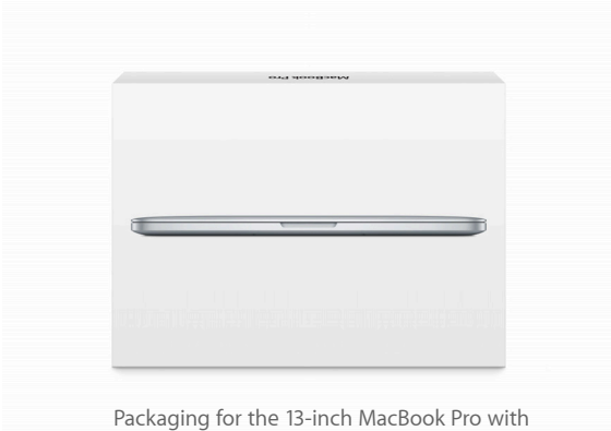
Packaging for the 13-inch MacBook Pro with Retina display is extremely material efficient, allowing at least 15 percent more units than the original 13-inch MacBook Pro to fit in each shipping container.

The 13-inch MacBook Pro with Retina display features a breakthrough battery design that dramatically improves its lifespan—up to five years. So it uses just one battery in the same time a typical notebook uses three.