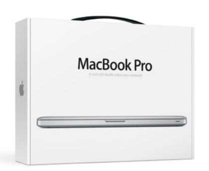
The 15-inch MacBook Pro retail packaging consumes 35 percent less volume than the original 15-inch MacBook Pro. Its retail and shipping packaging contain three times as much post-consumer recycled content as the original 15-inch MacBook Pro.

The 15-inch MacBook Pro features a breakthrough battery design that dramatically improves its lifespan—up to five years. So it uses just one battery in the same time a typical notebook uses three.