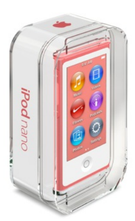
The retail packaging for iPod nano consumes 64 percent less volume, and is 32 percent lighter than the first-generation iPod nano packaging.