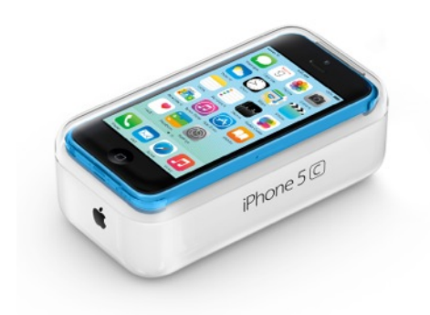
U.S. retail packaging of iPhone 5c is 47 percent lighter and consumes 45 percent less volume than the first-generation iPhone packaging.