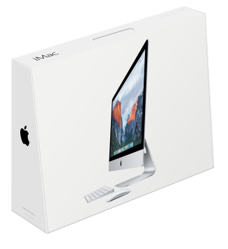
The 27-inch iMac with Retina 5K display retail packaging consumes 37 percent less volume and weighs 18 percent less than the original 15-inch iMac packaging.