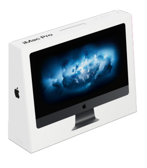
The U.S. retail packaging of iMac Pro contains 78 percent less plastic than the 27-inch iMac with Retina 5K display, and contains 85 percent recycled content.