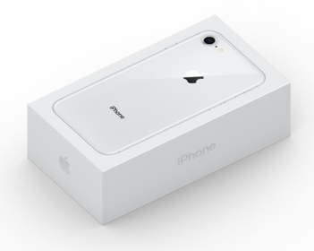
U.S. retail packaging of iPhone 8 contains 79 percent less plastic than iPhone 6s packaging and contains 59 percent recycled content.