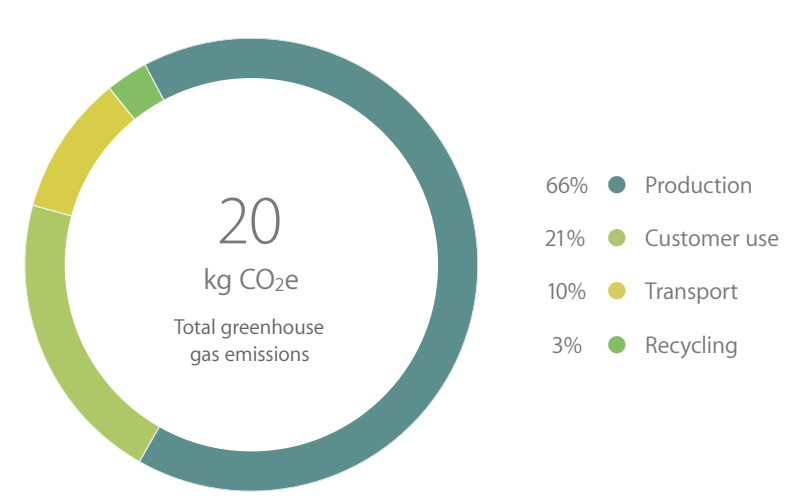
Greenhouse Gas Emissions for Apple Watch Series 1 42mm Aluminum Case with Sport Band<sup>1</sup>

Greenhouse gas emissions have an impact on the planet's balance of land, ocean, and air temperatures. Most of Apple's corporate greenhouse gas emissions come from the production, transport, use, and recycling of its products. Apple seeks to minimize greenhouse gas emissions by setting stringent designrelated goals for material and energy efficiency. The chart below provides the estimated greenhouse gas emissions for Apple Watch Series 1 over its life cycle.