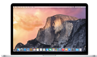
Model MJLQ2 Date introduced May 19, 2015