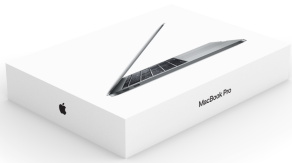
U.S. retail packaging of the 13-inch MacBook Pro contains an average of 38 percent recycled content by weight.