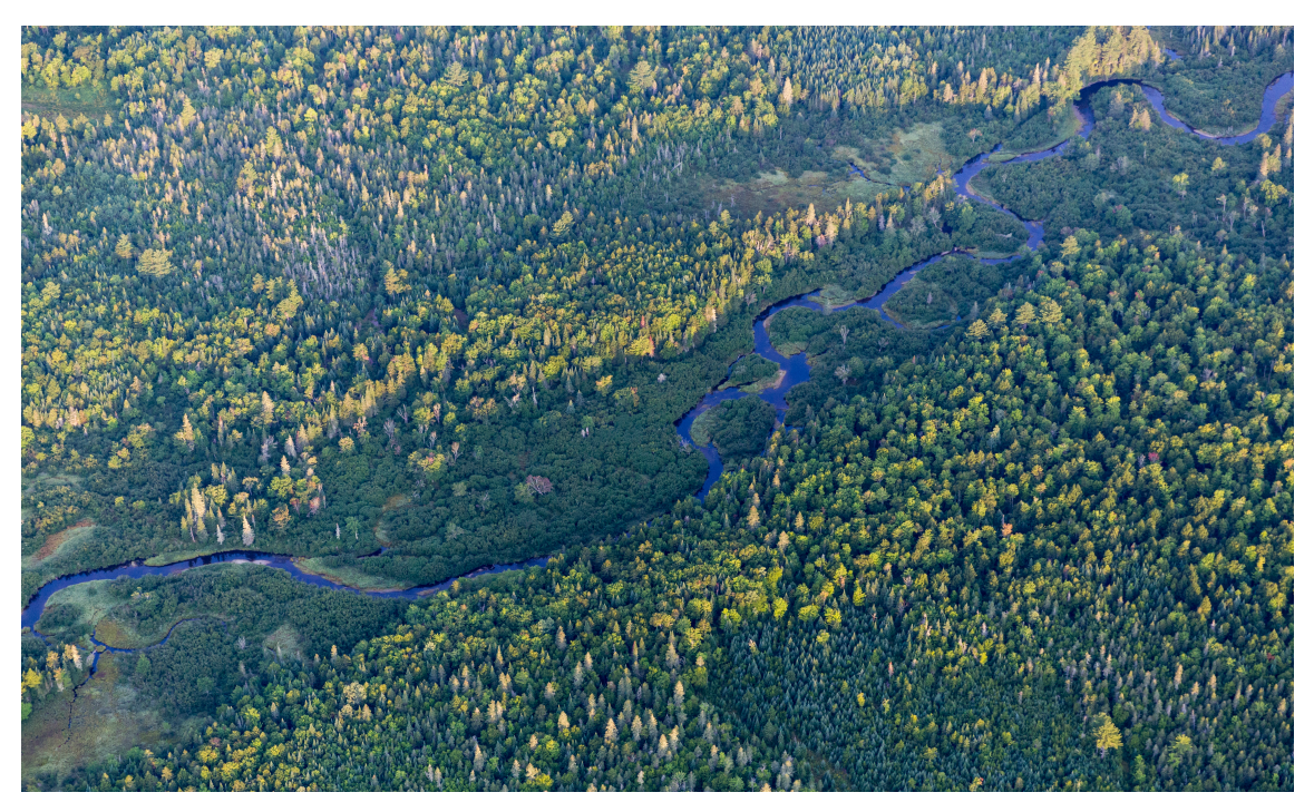
Apple and The Conservation Fund are protecting Reed Forest in Maine.

Through its Working Forest Fund, the Fund aims to ensure the vital role of forests in providing clean air and water, wildlife habitat, and economic benefits for communities across the United States. With support from Apple, the Fund identifies and purchases working forests with ecological and economic assets that were threatened by large-scale fragmentation or development. The Fund then places a conservation easement on the land to ensure that it is sustainably managed and protected from development in perpetuity. Once appropriate partners are found, the Fund transfers the easement to a qualified holder responsible for its enforcement, and sells the forest in the open market. After the sale of the property, they reinvest funds from the sale to protect additional working forests, boosting local economies by maintaining jobs and creating a supply of responsibly managed forest products.<sup>14</sup>