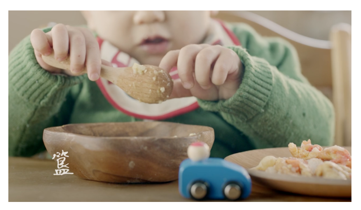
The WWF China "Green Me" campaign video asks, "The forest is part of our life. How can we give back to it?"

Apple elected to partner with World Wildlife Fund (WWF) because of the NGO's technical expertise, experience in partnering with the Chinese government and other regional partners, and previous work in generating the supply of and demand for responsibly produced forest products. Through a proposed initiative designed to increase demand for responsibly produced forest products, as well as to improve forest management practices and national forest management policies, WWF offered the long-term focus adapted to the Chinese market that Apple sought.