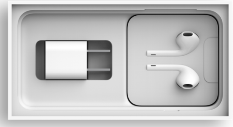
iPhone 7 packaging

A similar exploration of new materials and design led to innovations in the EarPods carrier. For iPhone 6s, a plastic carrier had been designed to discreetly wrap cables and hold the EarPods in place. For iPhone 7, Apple developed a paperboard-based solution to leverage a functional set of folds and cuts that elegantly secured the EarPods and cable. Changes to the tray and EarPods carrier contributed to an 84 percent decrease in plastic usage for iPhone 7 packaging compared with iPhone 6s.9