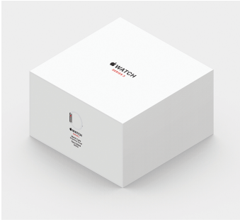
Apple Watch Series 3 (GPS + Cellular) retail packaging contains at least 39 percent recycled content.

The retail packaging for Apple Watch Series 3 (GPS + Cellular) is highly recyclable, and 100 percent of the fiber in its retail box is from either recycled content, bamboo, waste sugarcane, or responsibly managed forests. The following table details the complete set of materials used in the Apple Watch Series 3 (GPS + Cellular) packaging. 1