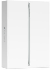
Retail packaging for iPad mini 4 uses a minimum of 38 percent post-consumer recycled content.