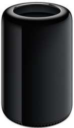
Models MD878, MQGG2 Date introduced October 22, 2013