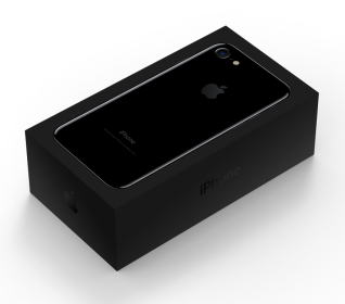
U.S. retail packaging of iPhone 7 contains 84 percent less plastic than the previous-generation iPhone packaging and contains 60 percent recycled content.