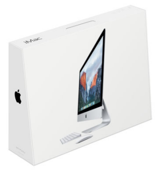
The 27-inch iMac with Retina 5K display retail packaging consumes 37 percent less volume and weighs 18 percent less than the original 15-inch iMac packaging.